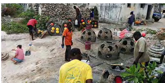
Reef ball production in collaboration with fishermen

In collaboration with the Kibigija fishery committee, our local partners and a training crew from the United States, we built 86 reef balls of various sizes over the course of 8 days and sank them in a carefully selected location in the lagoon. The fishermen involved are now planning to declare the area a No Take Zone. We welcome their initiative and will assist in marking the zone with buoys. The enforcement of the protective zone will be up to the fishery committee. We are looking forward to following their efforts.