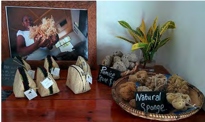
Products on sale at Seaweed Center Paje

This year we are planning to launch a new, third farm. We are already raising seedlings in our breeding farm to supply the Mtende farm and additional farms. However, it is not possible to grow farms very quickly. This is the price to be paid for sustainability. But as the number of sponge farms in Zanzibar grows, the more quickly they will multiply, thus allowing more and more members of the local community to benefit from this new source of income.