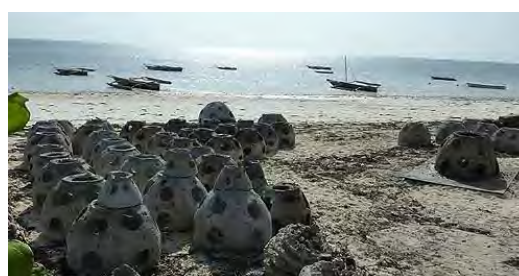
Drying before deployment

The artificial reef project has also proven an excellent platform from which to educate the local community on topics such as pollution and the importance of coral reefs for the preservation of biodiversity. Because they are built on land and can be seen and touched, the reef balls – or “fish houses,” as the villagers call them - provide a particularly engaging opportunity for education. After conducting promising first awareness events for fishermen and school children, we decided to expand these efforts. Our Dutch funding partner coralfreecare.com has generously pledged additional funds for a continuing awareness campaign of this kind.