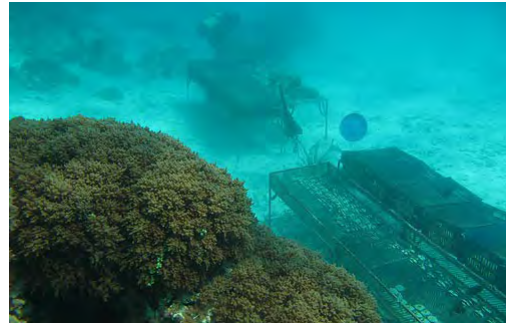
Part of the new coral farm in Jambiani

Our goal for 2015 is to develop breeding stock to allow the farmers to draw their seedlings exclusively from it. Additionally, for us to develop ten high-quality products for larger-scale production by the end of 2015, the individual cultivation methods will need to be adapted to local conditions and refined for each seedling species. By early 2016 we are aiming to have evaluated potential buyers so as to start the production and sale of soft corals. For hard corals, a CITE export permit is required. To obtain this permit, the development of breeding stock is of crucial importance, for only if we are able to document our ability to produce corals sustainably will the necessary export permit be approved.