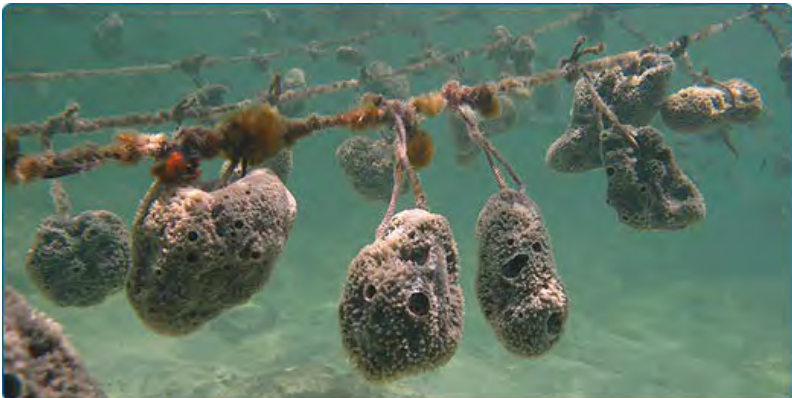
Sponges in our Jambiani farm

In the not too distant future – as soon as the farm consistently generates $300-$400 in monthly sales - we will be able to transition our first two farmers to self-employment. The two women and their families will be able to live comfortably on this income. However, even after this transition, we will continue to assist to these two farmers and intervene if quality control so requires.