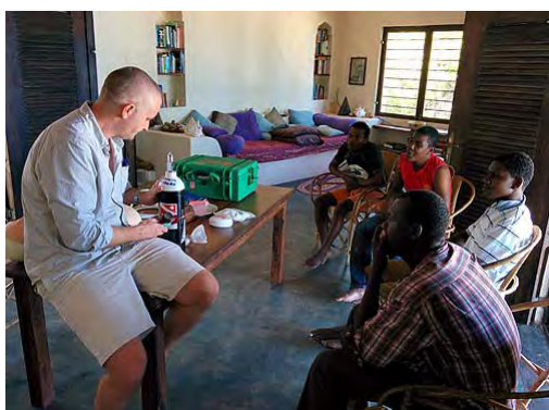
Oxygen Training & First Aid Course

In addition, we have entered into a partnership with the Institute for Chemistry and Biology of the Marine Environment (ICBM) at Oldenburg University within the framework of the Coral Diversity Network (CoDivNet). Starting 2015, we will participate in the DAAD Qualitätsnetzwerk Biodiversität (Quality Network on Biodiversity) development programme, an issue-based partnership with institutions of higher education in developing countries with the aim to foster the preservation of biodiversity and research on related subjects. In addition to University of Dar es Saalam Tanzania (the parent organization of our current partner, the Institute of Marine Science Zanzibar (ISM)) the University of Quintana Roo, Mexico is also involved. Among other things, the program aims to explore and test the sexual reproduction of corals – a cultivation method that does not involve the asexual fragmentation process currently used around the world. The collaboration, which is set to last three years, has the potential to have a large impact on our coral cultivation initiative in East Africa.