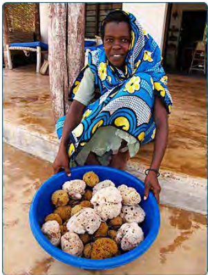
Key with a harvest

As of early 2015, our efforts have yielded some great results: we have sold more than $1,000 worth of sponges – an amount that covers the cost of employing our first sponge farmer. In addition, through the continuous trimming of sponges, we were able to not only satisfy our own demand for seedlings but to produce an excess, which will contribute to our ability to develop additional farms and create additional jobs. This also demonstrates that our cultivation of sponges is fully sustainable, an achievement that is likely unprecedented worldwide, as other farms - even those that have achieved sustainability - obtain their seedlings from the ocean rather than through cultivation.