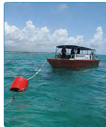
Buoy in use by a dive boat

In light of this success, we received a larger project budget for 2015 and will after consultation with the region's dive organizations be able to install buoys in Mnemba Island Marine Park, if we receive the necessary permits. As soon as our budget allows, the project will also be