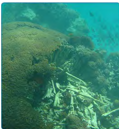
Likely anchor damage

Our objective for the 2013 pilot phase was to develop stable anchors for buoys and to determine to what extent buoys reduce the practice of throwing out anchors and whether an awareness campaign will be necessary to increase uptake. The result was very encouraging: in 2014, the buoys were frequently used by dive boats and dows transporting tourists. We also learned that boatmen often reprimand and educate colleagues who do not use the buoys. Our educational work in this regard has been a success.