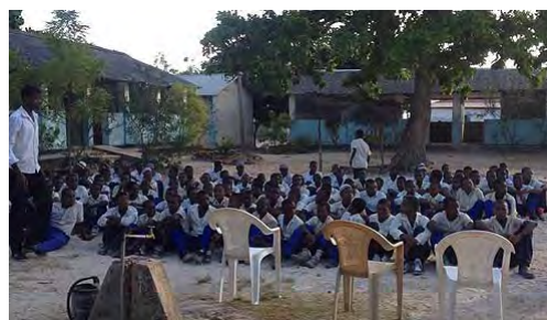
Awareness event at the local secondary school.