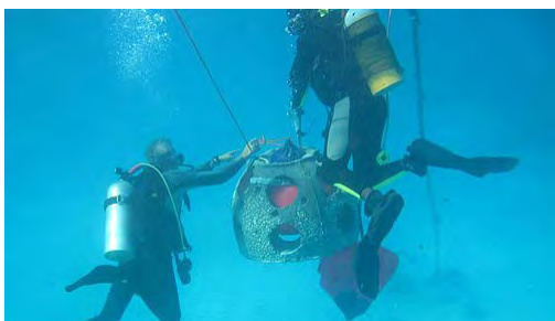
Reef ball placement

The artificial reef project has also proven an excellent platform from which to educate the local community on topics such as pollution and the importance of coral reefs for the preservation of biodiversity. Because they are built on land and can be seen and touched, the reef balls – or “fish houses,” as the villagers call them - provide a particularly engaging opportunity for education. After conducting promising first awareness events for fishermen and school children, we decided to expand these efforts. Our Dutch funding partner coralfreecare.com has generously pledged additional funds for a continuing awareness campaign of this kind.